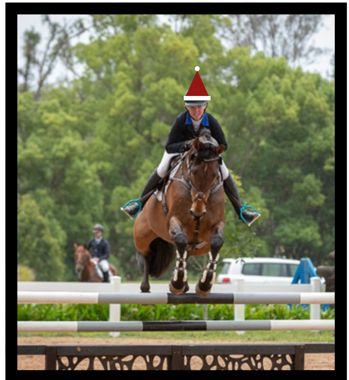
Fig Tree Pocket was the first event "My Locky" competed in after his accident, and he did not disappoint! The next event we took him to Toowoomba International Event to test things a little more. Leading after the dressage, a clear showjumping round kept them in the lead. Cross-country day was exciting and they galloped around the course, jumping like a pro they came in with only a couple of time faults. Finishing in second, we could not have been happier.